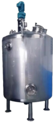
Brine (Chemical) Mixing Tank