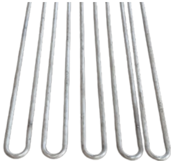
All Types Of Pipe Bending Job Work