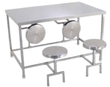
Dining Table With Seater