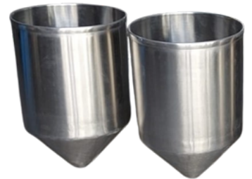
All Types Of Hopper in SS