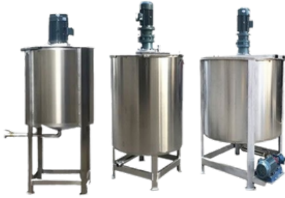
Chemical Mixing Tank With Agitator