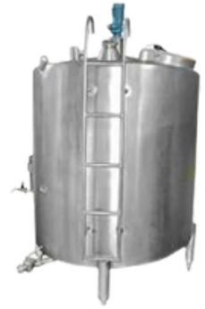
Milk Storage Tank