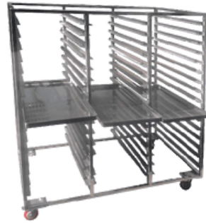
Tray Dryer Machine Trolley